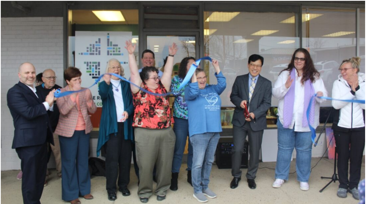
The Remnant Faith Community - March 22nd