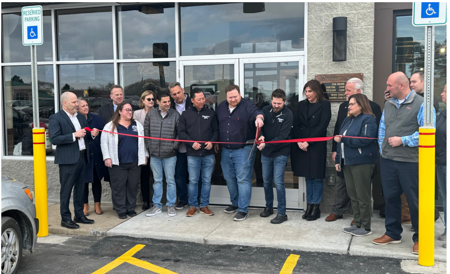
Primanti Bros. Restaurant & Bar - March 20th